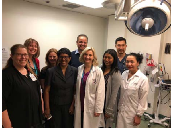
Above: St. Joe's Laboratory Medicine and Emergency Department staff members who collaborated on the process improvements.