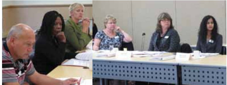
Council approved the redefinition of CMLTO electoral districts to align them with LHINs rather than District Health Councils.

The Canadian Alliance of Medical Laboratory Professionals Regulators (CAMLPR) met in Montreal in October. CAMLPR is comprised of the Registrar/Executive Directors of the MLT regulatory bodies from Alberta, Manitoba, New Brunswick, Nova Scotia, Ontario, Quebec and Saskatchewan. Discussions focussed on approving bylaws and the exchange of information and sharing knowledge about regulatory trends, leading practices, policy and legislation.